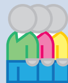
The Public and Local Stakeholders